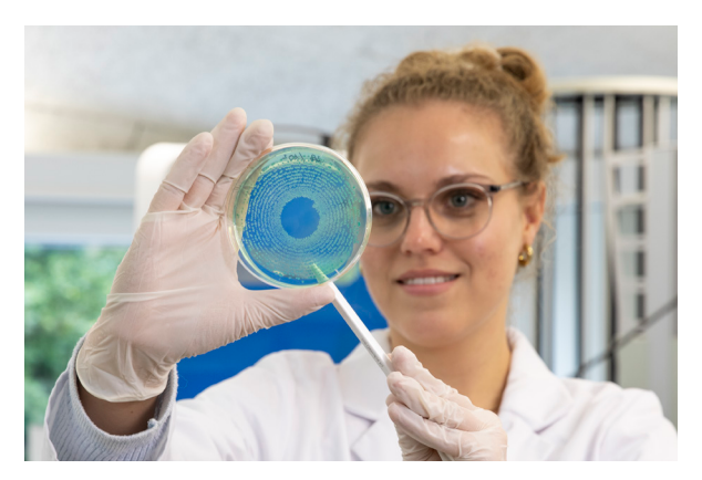
Benign primary bacteria stop other microorganisms from growing.