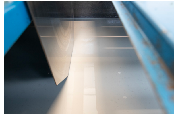
Stable emulsion tolerant to tramp oil ensures long sump life.