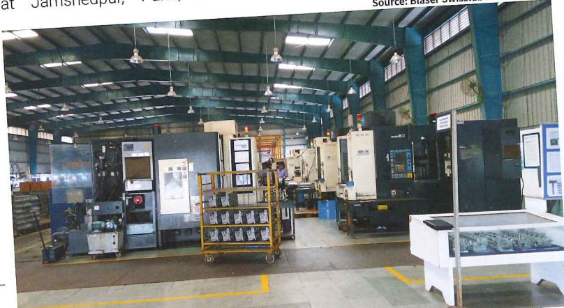
A view of RSB Transmission's shopfloor.